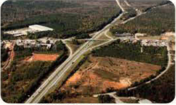
I-26 & I-385 Interchange