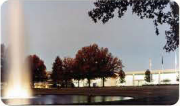
Greenville-Spartanburg International Airport Front View