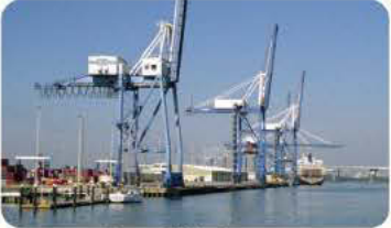
Port of Charleston